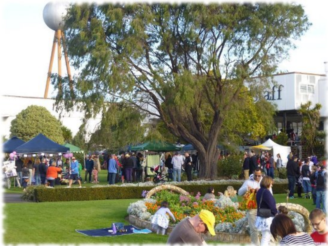
The Fletcher Jones spring garden party was held in perfect sunshine and

part of something that brings people on mass back into the Fletcher Jones gardens is more than special!"