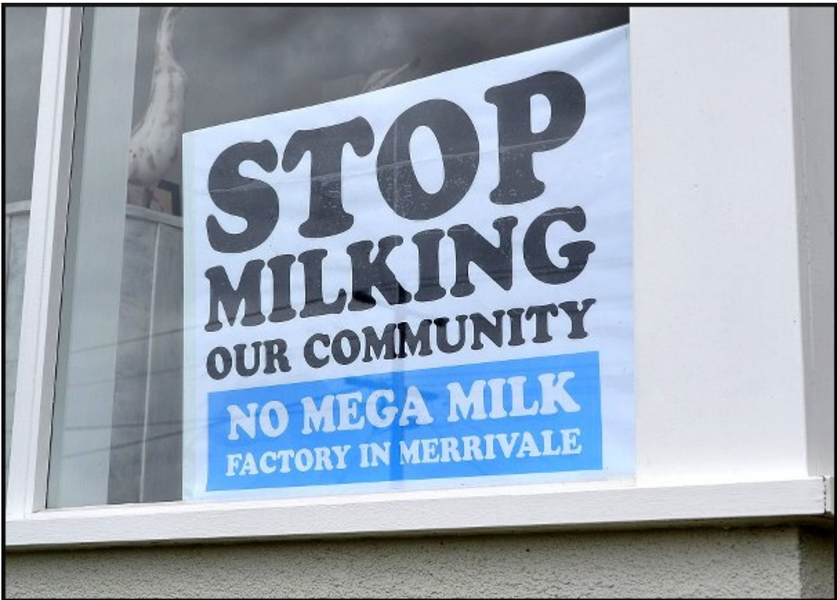
Signs like this one have been popping up in windows and on fences around