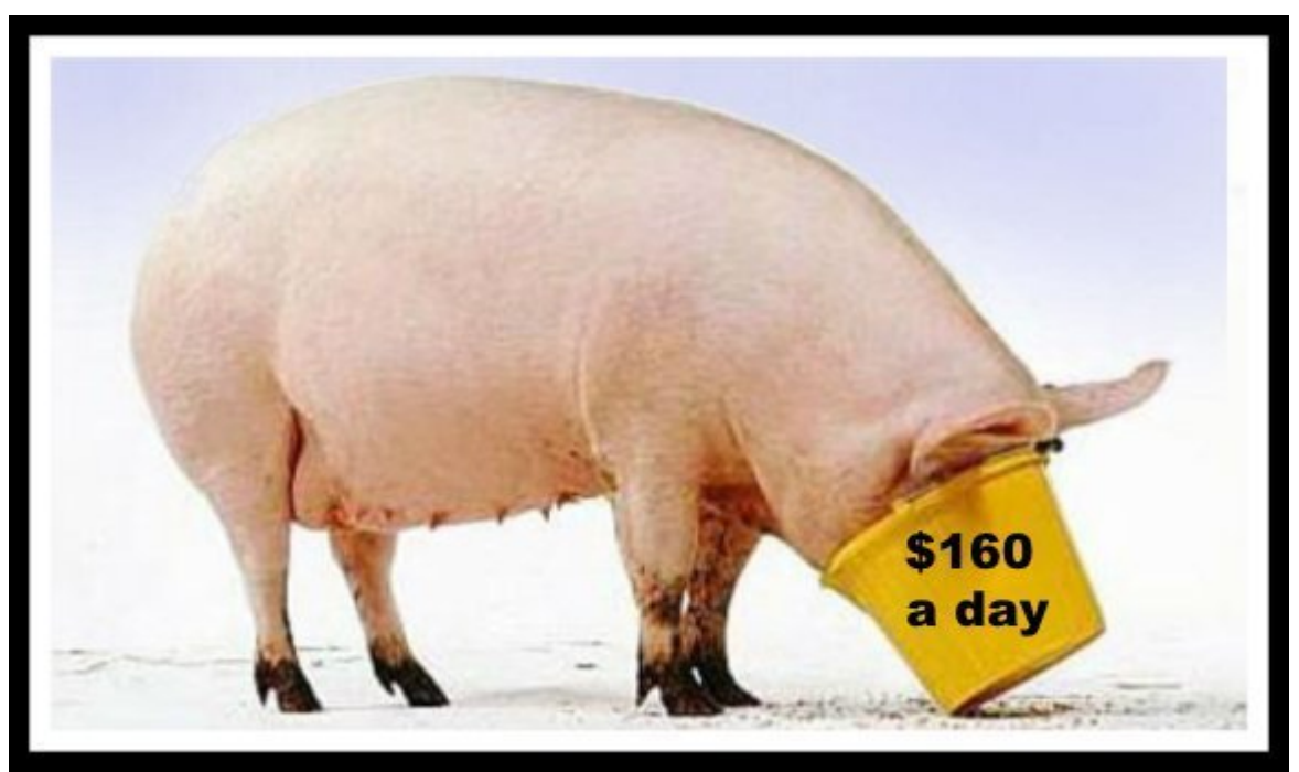
Life at the trough: The new Warrnambool City Council travel allowance includes $160 per person, per day for meals.