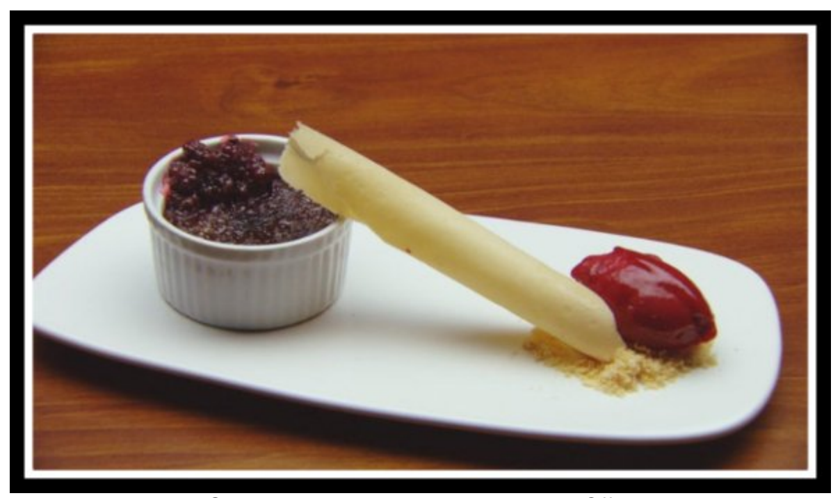
Hold dessert: The NSW public service and Australian Tax Office both recommend daily dinner allowances well below that of the WCC. Image: Lusciouslife

By the way, the Australian Tax Office suggests a "reasonable" meal allowance while travelling is a maximum of $101 a day, including around $48.60 for dinner.