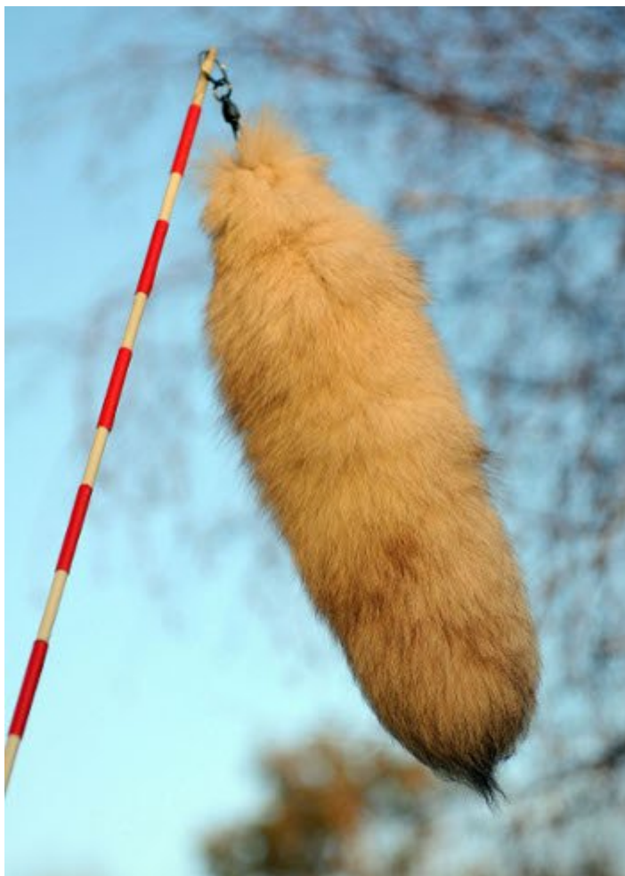
The authentic Arctic foxtail recycled from a fur coat.