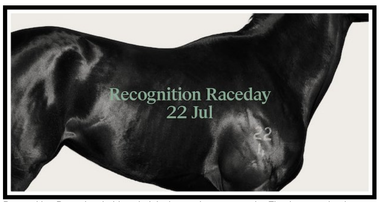
Recognition Race day, held each July, is a major event on the Flemington calendar

But wait, there's more. There always is.