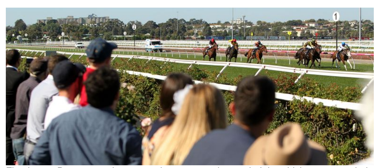
Flemington Racecourse hosts a major race meeting each July, which corresponded