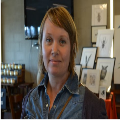
Our first quiet hero