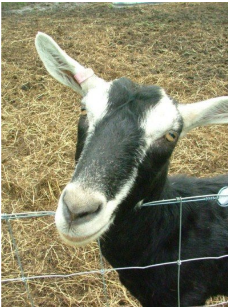
Issy, the founding goat of Make Mine Milk.

[dropcap style="font-size: 60px; color: #A02F2F;"]A [/dropcap] RATHER GORGEOUS looking goat called Isabelle is the silent partner behind the skin creams, soaps and lip balms of Make Mine Milk.